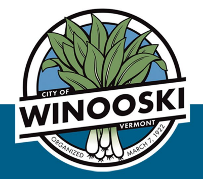
Mayor Kristine Lott City of Winooski