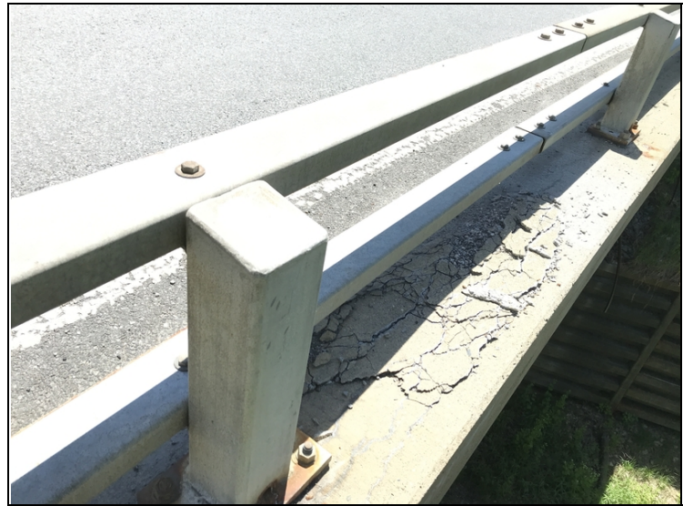
Eroding curbing at West mid-span