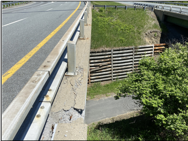
Eastern Curb / Fascia Cracking / Scaling