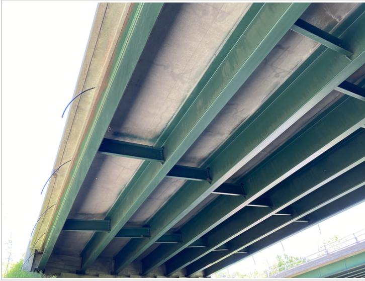
Superstructure from South End