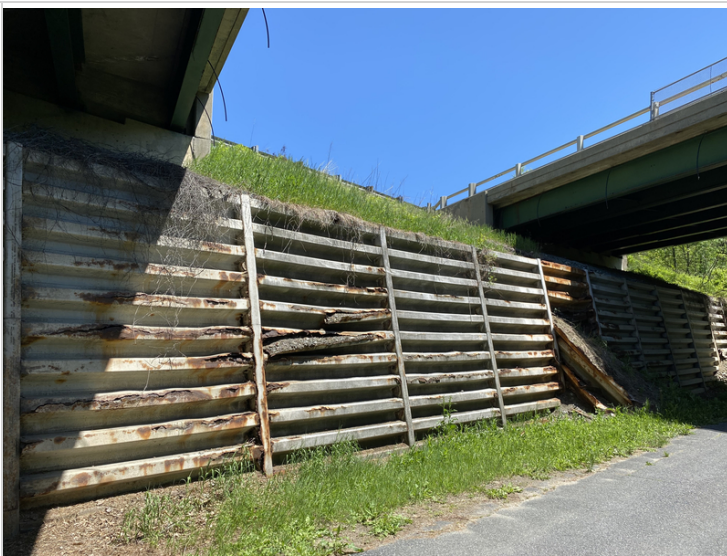
Failing Retaining Wall Northeast Corner of Structure