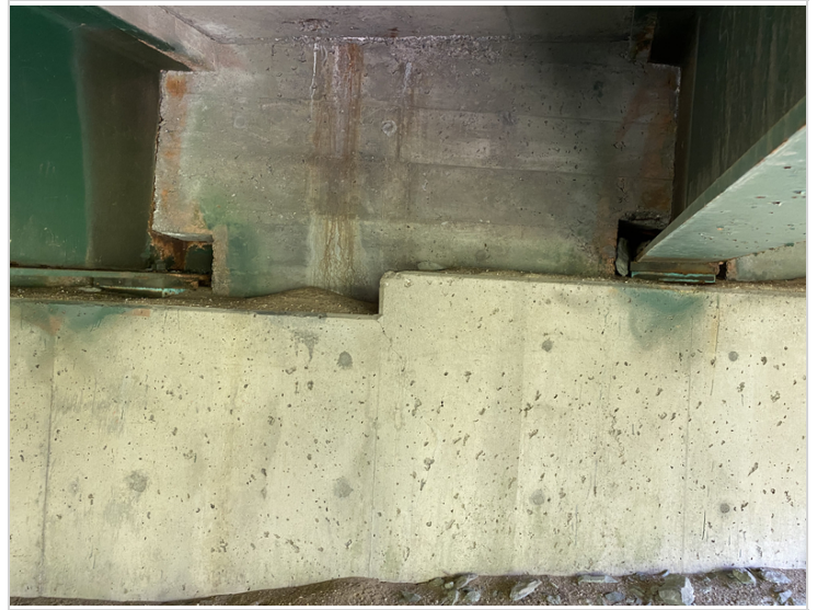
Abutment #2 between Beams #4 and #5