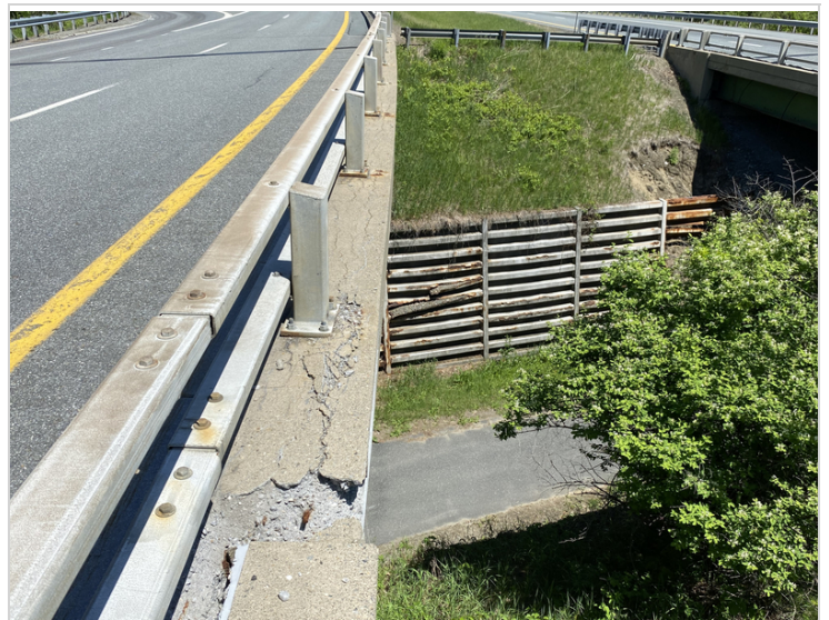
Eastern Curb / Fascia Cracking / Scaling