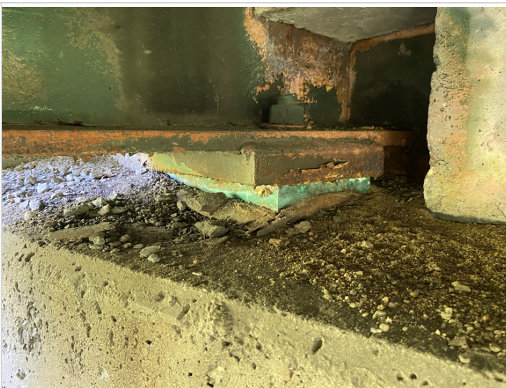
Bronze Bearing #1 at Abutment #2