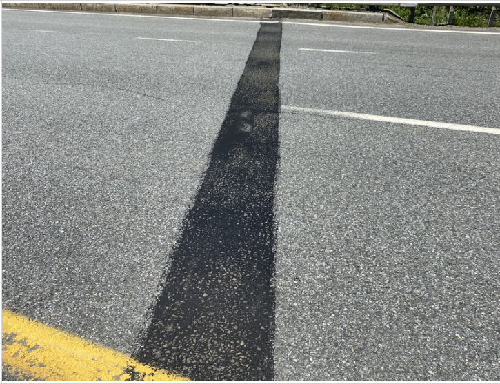
Asphaltic Plug Joint over Abutment #2