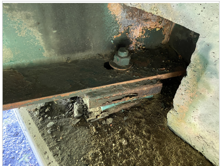
Bronze Bearing #1 at Abutment #1