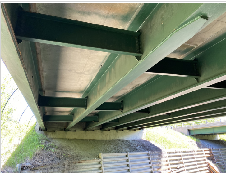
Superstructure from Southwest Corner