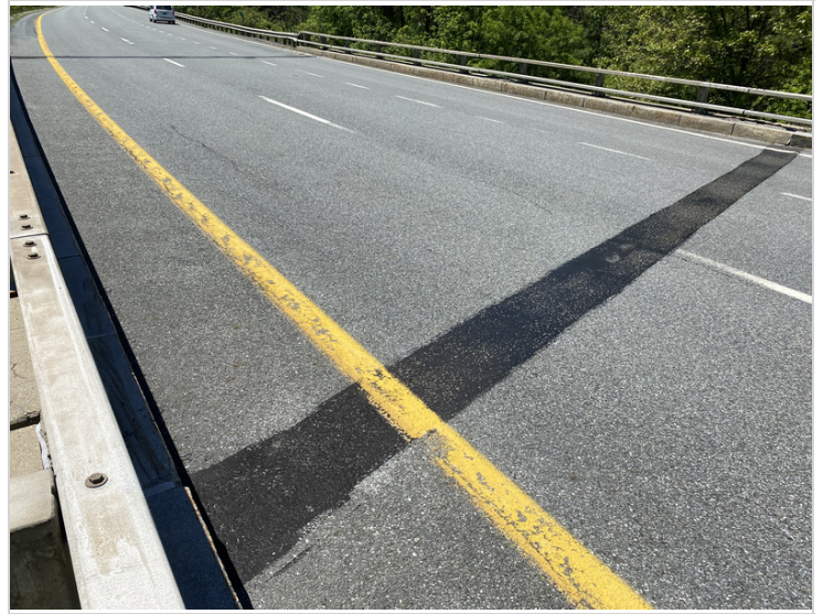
Deck Wearing Surface from Northeast Corner