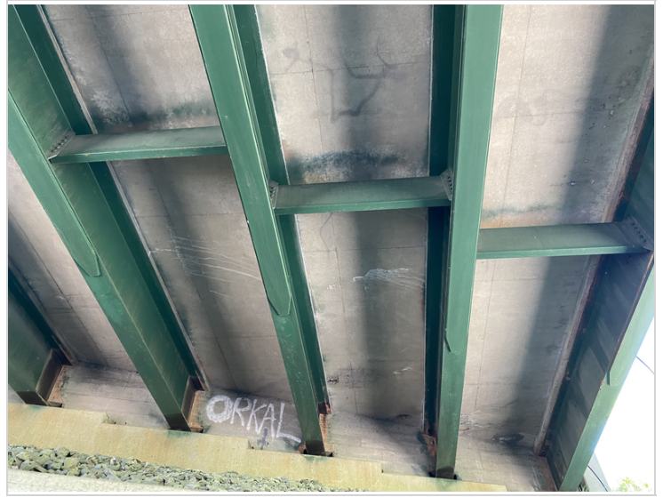
Bays #1 through #3 Deck Soffit South End