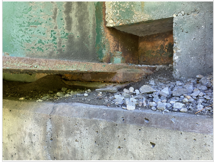
Fixed Steel Bearing #1 at Abutment #1