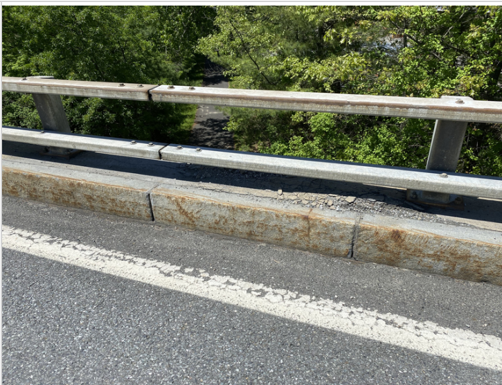
Western Curb Heavy Spalling