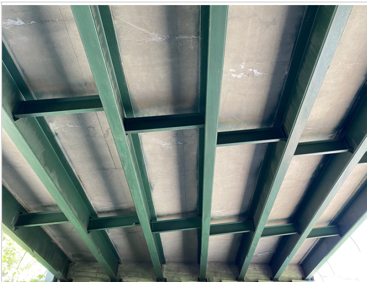
North End Deck Soffit