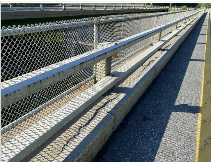
Eastern Curb Spalling