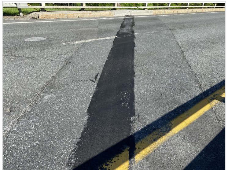
Asphaltic Plug Joint over Abutment #1