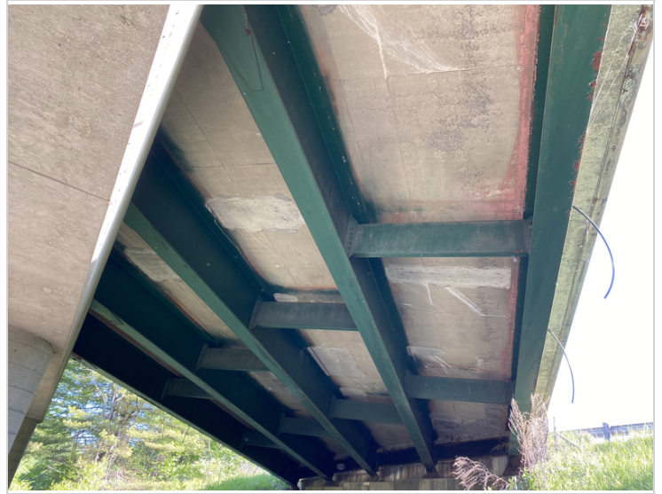
Span #3 Superstructure