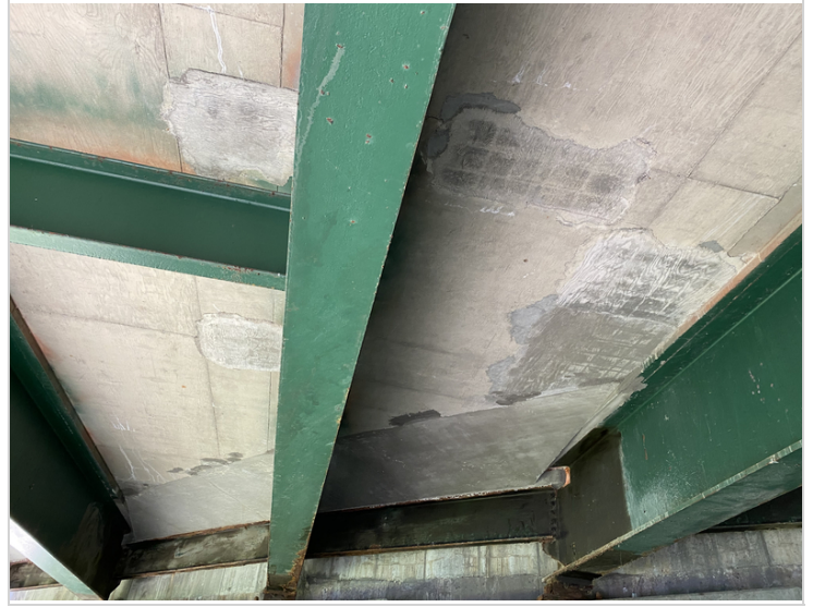
Span #1 Deck Soffit Bays #2 and #3