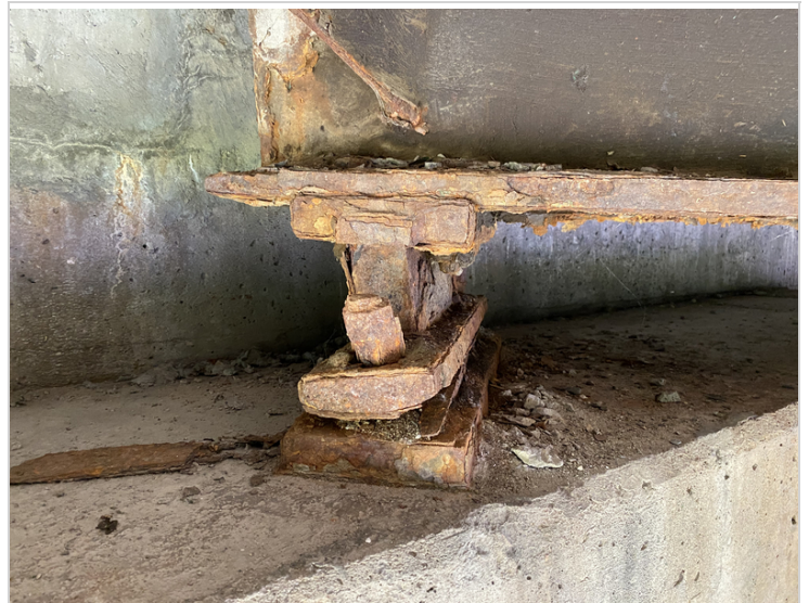
Bearing #3 at Abutment #1