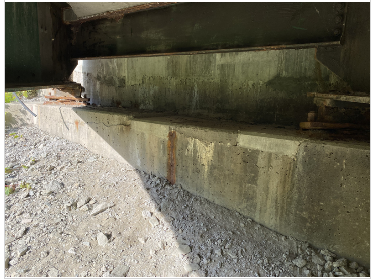
East End Abutment #1