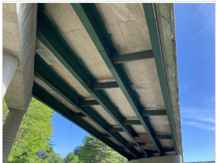
Span #2 Superstructure