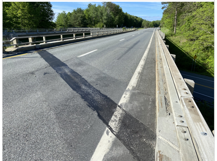
Deck Wearing Surface from Abutment #2