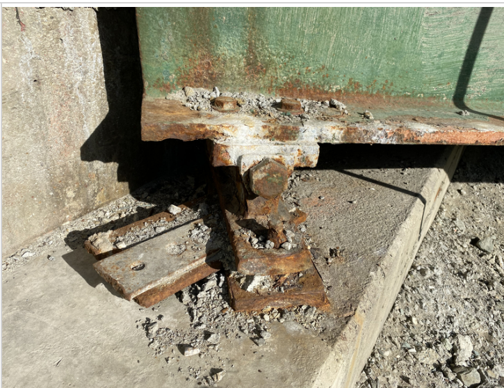
Bearing #5 at Abutment #1