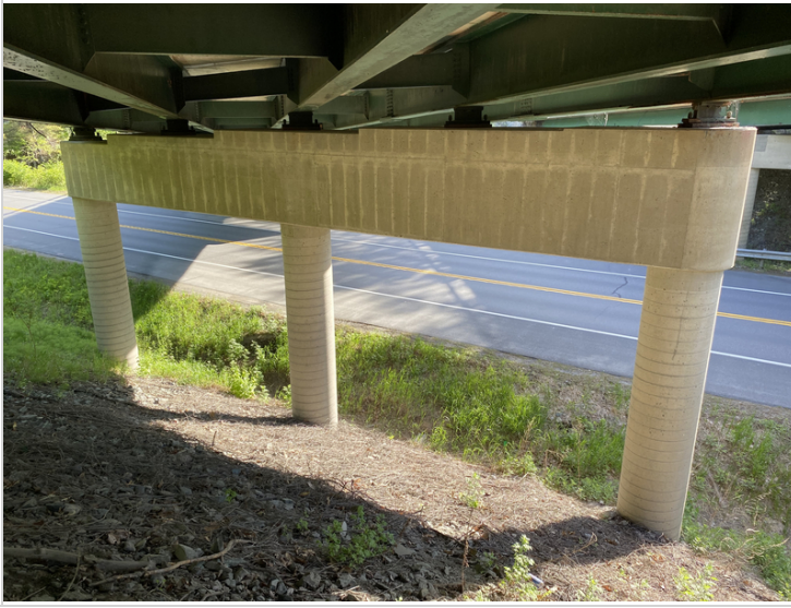
Pier #1 Span #1