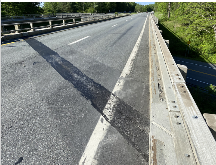
Deck Wearing Surface from Abutment #2