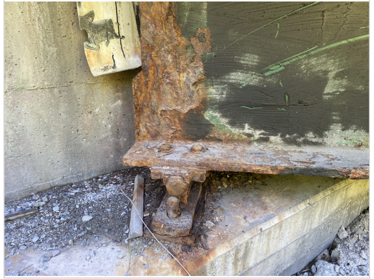
Bearing #1 at Abutment #2