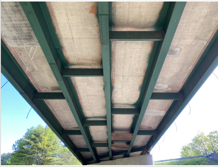
Span #2 Deck