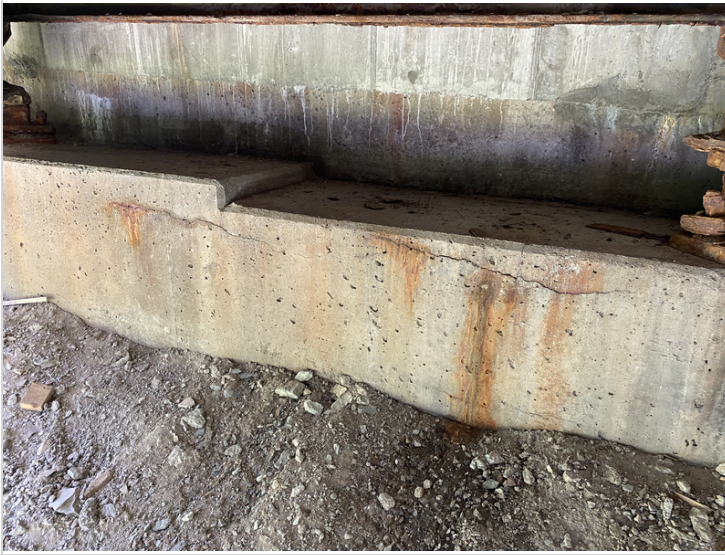
Abutment #1 Top Edge Bridge Seat Between Bearings #3 and #4