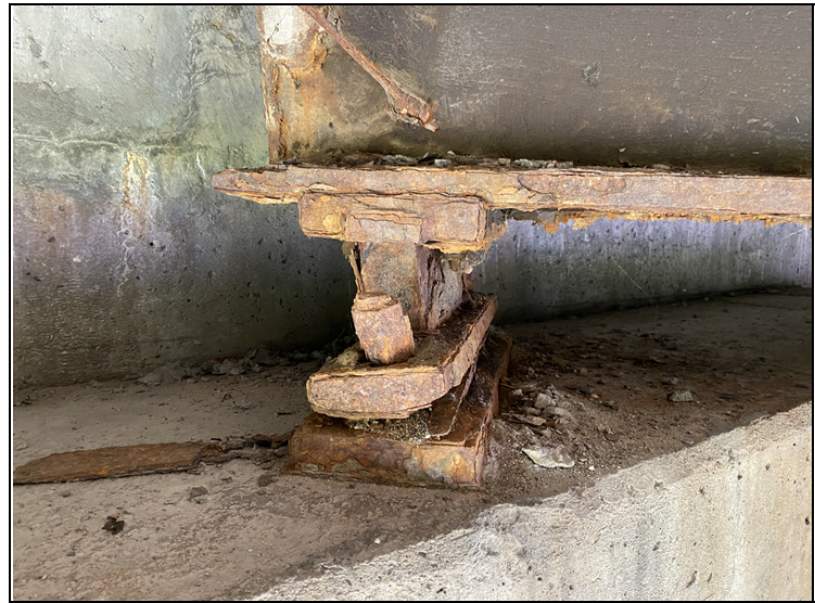
Bearing #3 at Abutment #1