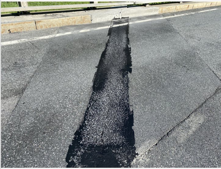
Asphaltic Plug Joint over Abutment #1