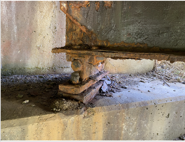
Bearing #5 at Abutment #2