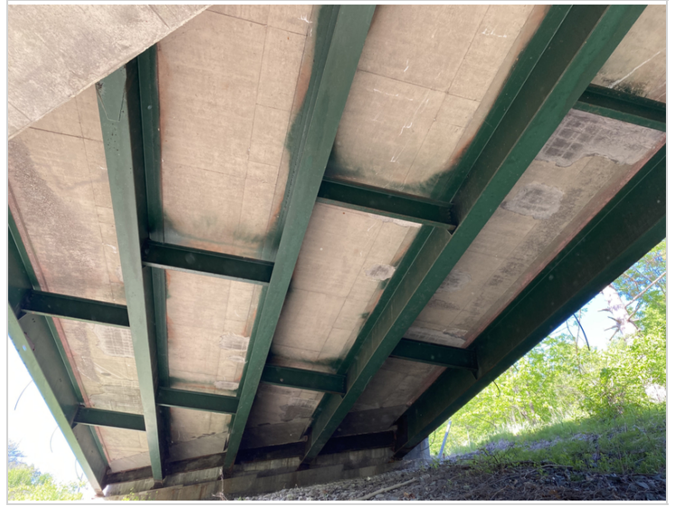
Span #1 Deck