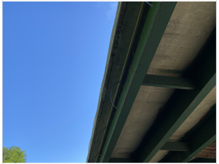
Eastern Fascia Soffit over US-5