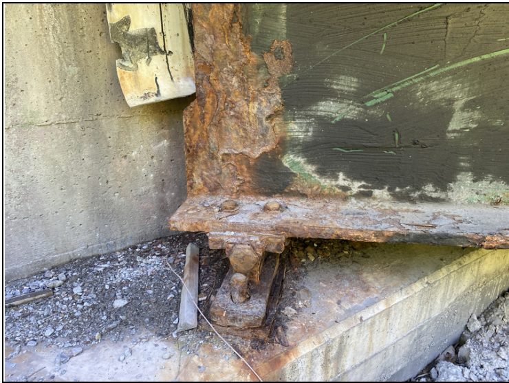
Bearing #1 at Abutment #2