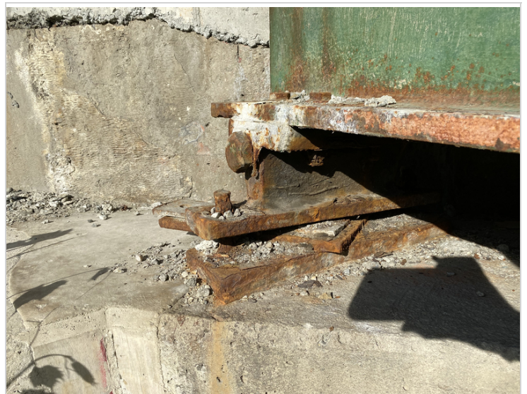
Bearing #5 at Abutment #1