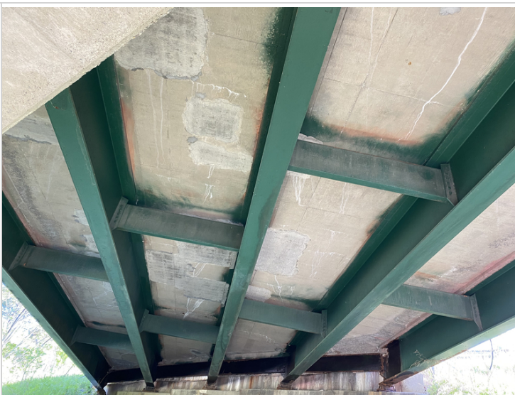
Span #3 Deck