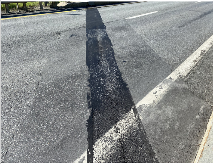
Asphaltic Plug Joint over Abutment #2