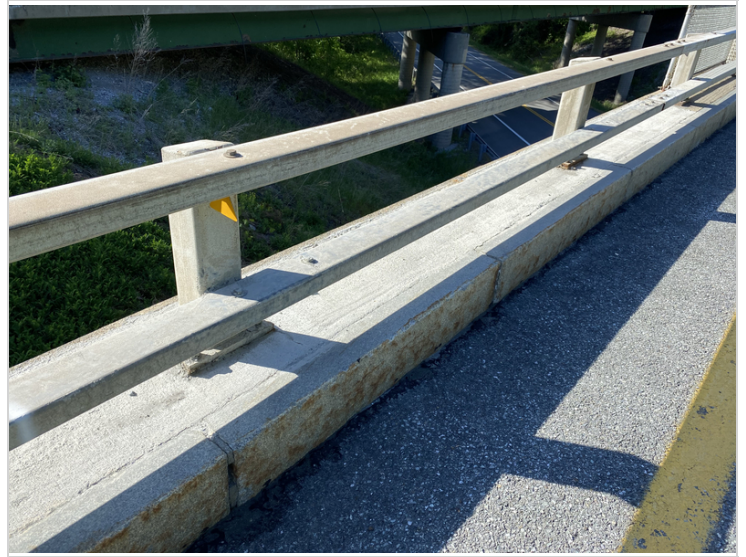
Eastern Curb Repairs