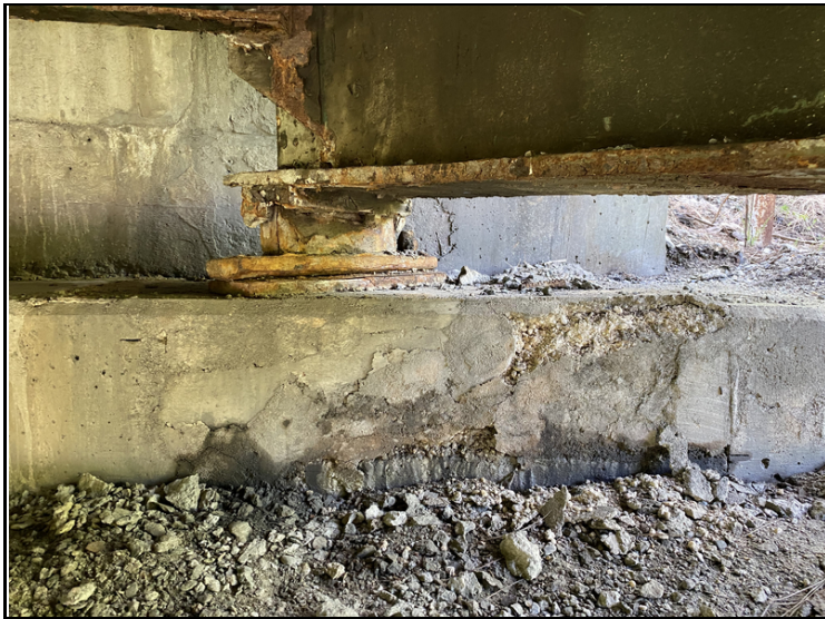
Bearing #1 at Abutment #1