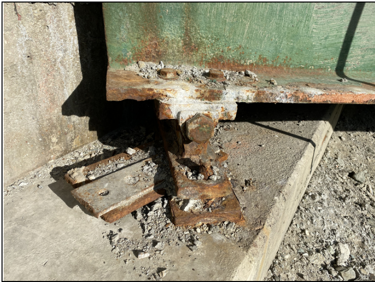
Bearing #5 at Abutment #1