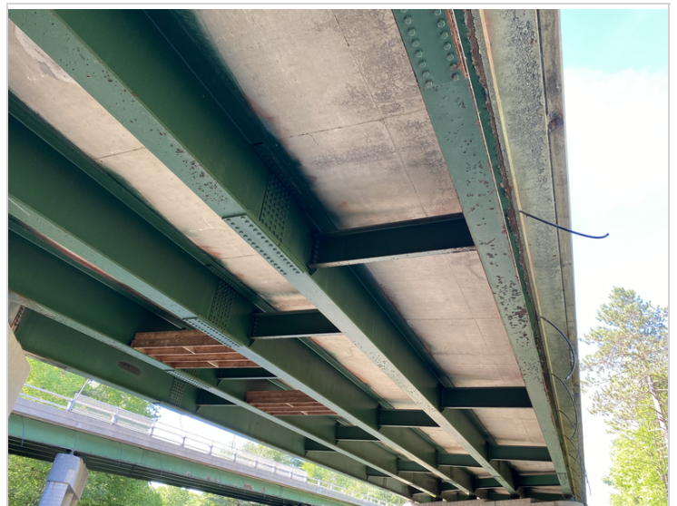
Span #2 Superstructure