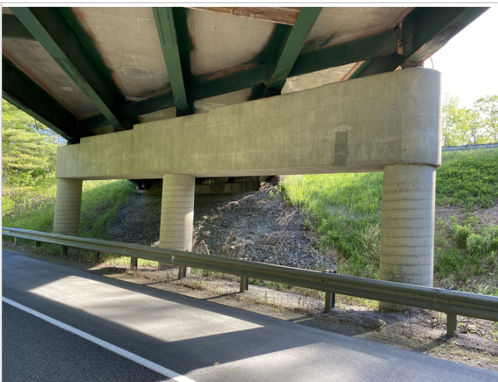
Pier #2 Span #2