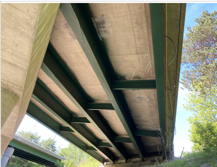
Span #1 Superstructure